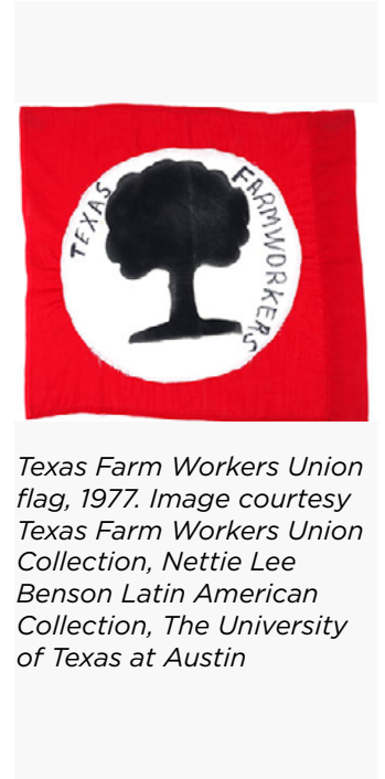
Texas Farm Workers Union flag, 1977.